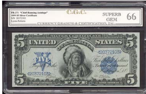
Fr.271 $5 1899 “Chief” CGC-66 Pop 1/0!