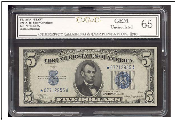
Fr.1651* $5 1934A STAR Silver Cert. CGC-65!!!