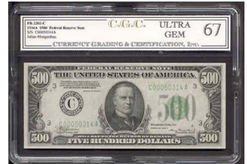
Fr.2202-C $500 1934A CGC-67 Pop 1/0!