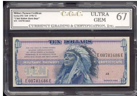
MPC 692 $10 Chief Hollow Horn Bear 67!