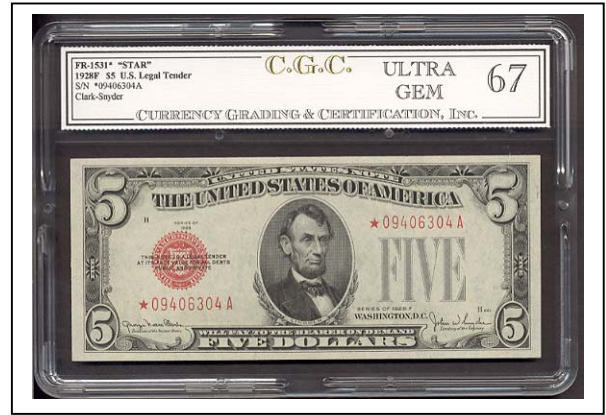
Fr.1531* 1928F $5 Red Seal Legal Tender STAR in CGC-67 Finest Known Pop-Top 1/0!!!