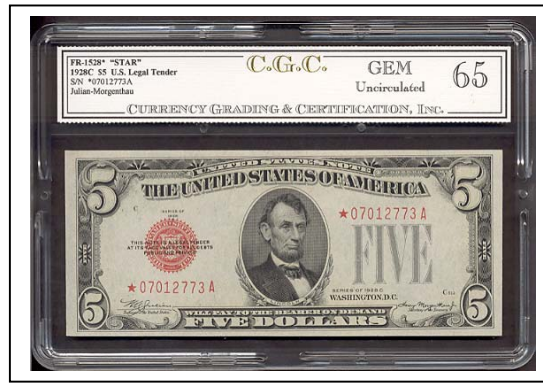
Fr.1528* 1928C $5 Red Seal Legal Tender Star in CGC-65 GEM, won't Last!!!