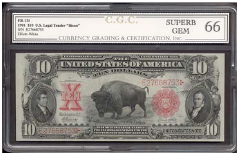
Fr.121 $10 1901 “Bison” CGC-66 Pop 1/0!