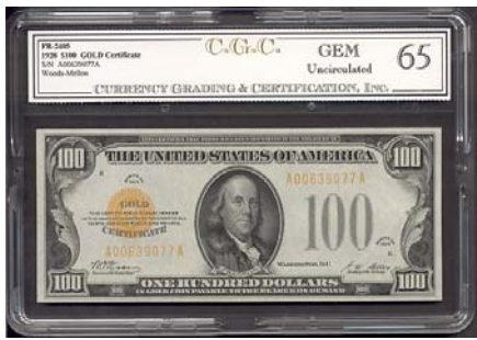
Fr.2405 $100 1928 CGC-65 Pop 1/0!