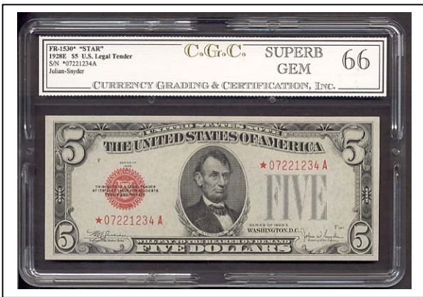
Fr.1530* 1928E $5 Red Seal Legal Tender STAR in CGC-66, Finest known, Pop-Top 1/0!!