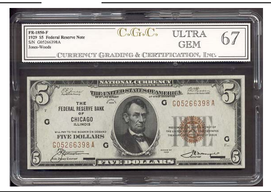
Wow, a Chicago 1929 Brown Seal in CGC-67! Nearly perfect everything, paper, embossing, etc...