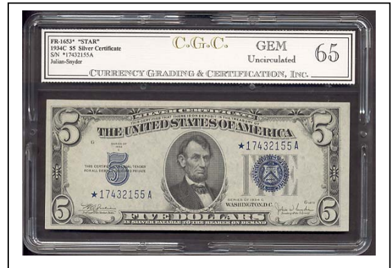
Fr.1653* $5 1934C $5 STAR Silver Cert. in CGC-65 GEM, what a killer note! Pop Top 1/0!

To bid or "Buy it Now" on any of these notes just email us at: Sales@gradedcurrency.com or call us Now at (602) 493-4758. Dealers & Collectors List or SELL you notes here: Color Photo's GradedCurrency.com