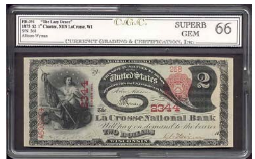
Fr.391 Original Lazy Deuce CGC-66 1/0!