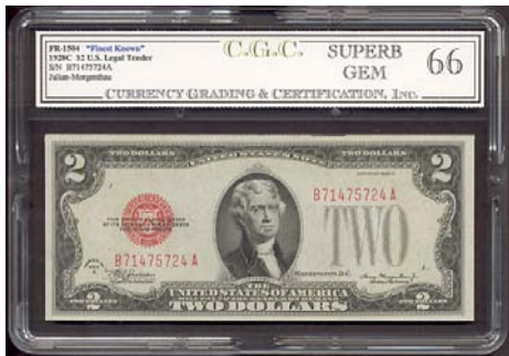
Fr.1503 $2 1928 “B” Key! CGC-66