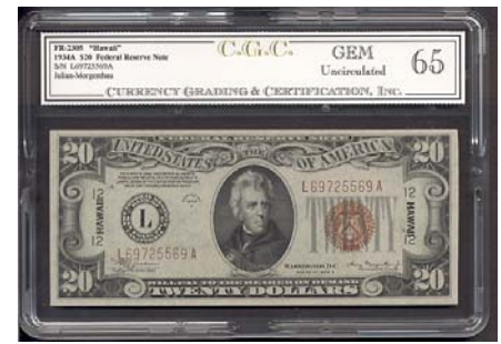
Fr.2305 $20 1934A Hawaii CGC-65 Pop 1/0!