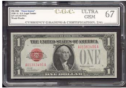
Fr.1500 $1 1928 Legal Tender Pop 1/0!