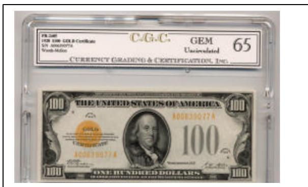
Well, you probably haven’t seen this before, we know we haven’t! A $100 1928 Fr.2405 Gold Certificate in Gem (CGC-65)! Won’t last!