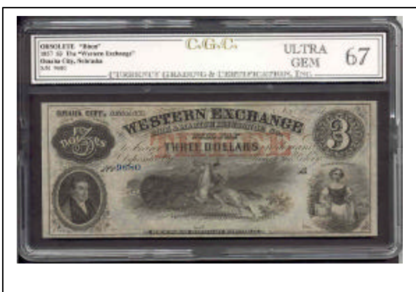
This Obsolete is a 1857 $3 “The Western Exchange” Fire & Marine Ins. Co. from Omaha City, Nebraska in an astonishing grade of CGC-67 Ultra Gem