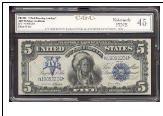
This Chief is just gorgeous, great colors and inking! Chief Running Antelope will probably always be within the top 3 in popularity! $1,500!

To bid or “Buy it Now” on any of these notes just email us at: Sales@gradedcurrency.com or call us Now at (602) 493-4758. Dealers & Collectors List or SELL you notes here: Color Photo's GradedCurrency.com