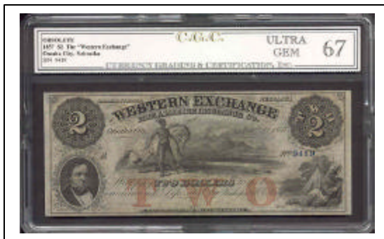
This Obsolete is a 1857 $2 “The Western Exchange” Fire & Marine Ins. Co. from Omaha City, Nebraska in an astonishing grade of CGC-67 Ultra Gem