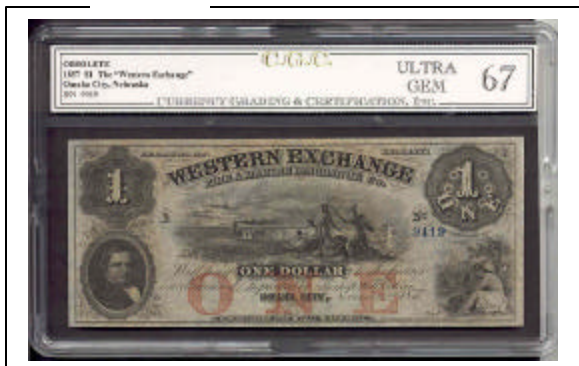
This Obsolete is a 1857 $1 “The Western Exchange” Fire & Marine Ins. Co. from Omaha City, Nebraska in an astonishing grade of CGC-67 Ultra Gem