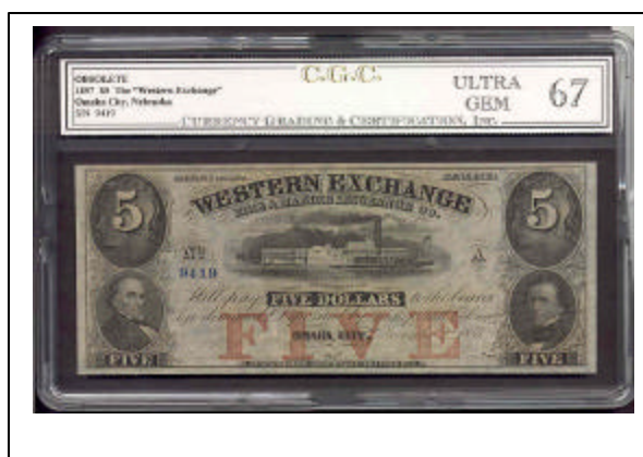
This Obsolete is a 1857 $5 “The Western Exchange” CGC-67 Ultra Gem! The Four notes that complete the set are being offered as a set only * Call Bid!*