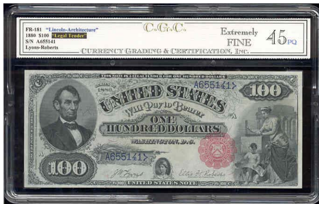
Possibly Finest known - previously sold as Uncl