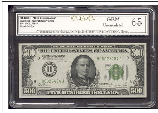
Fr.2200H 1928 $500 (about the 2 nd lowest mintage) Bright white paper, neon green inks CGC-65!