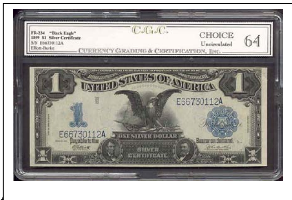
Gorgeous FR.234 $ 1 Black Eagle CGC-64, just a shave away from Gem!!!