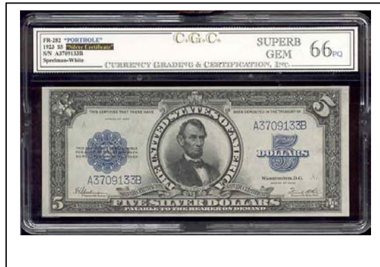
Fr.282 $5 Porthole! CGC has only graded 1 in 66 and this is it! Gorgeously original with vibrant color

To bid or "Buy it Now" on any of these notes just email us at: Sales@gradedcurrency.com or call us Now at (602) 493-4758. Dealers & Collectors List or SELL you notes here: Color Photo's GradedCurrency.com