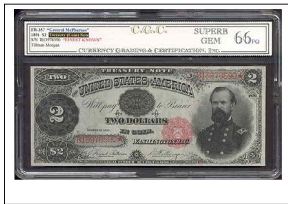
FR357 $2 Treasury (Coin) Note-Finest Known! Shear perfection, Population 2/0!