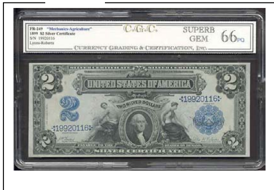
This Fr.249 $2 1899 – CGC 66PQ , a world class item of a very popular series (1899 Silver Certificates).