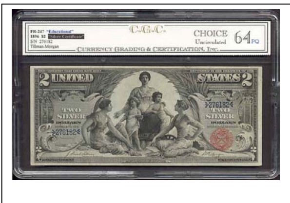
1896 $2 Educational! This note is about as close to a real GEM as you'll ever find! Great margins!