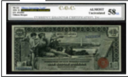
Fr.224 $1 ED Looks like a 66+++ cannot see the centerfold, really really gorgeous note, great price!