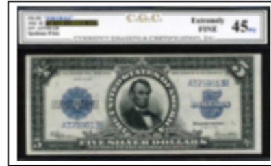
This Porthole almost looks Gem, with great centering, vibrant colors and majestic portrait of Lincoln!