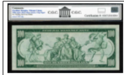
Fr.1104 $100! CGC conservatively graded this $100 Blue Fed a 65; however it has the all the looks of a 66!

To bid or "Buy it Now" on any of these notes just email us at: Sales@gradedcurrency.com or call us Now at (602) 224-5555. Dealers & Collectors List or SELL you notes here: Color Photo's Graded Currency.com