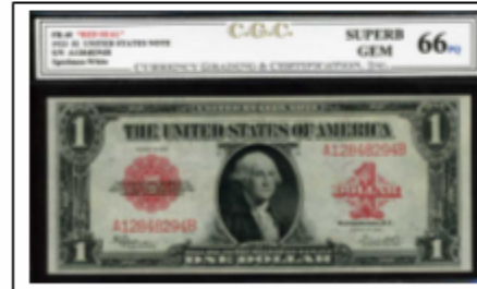
Fr. 40 1923 RED SEAL! Scan doesn't do justice -great colors!