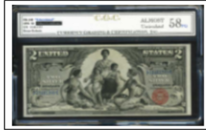
1896 $2 Educational! Great margins-the centering is dead on perfect! Nice white paper, sharp corners