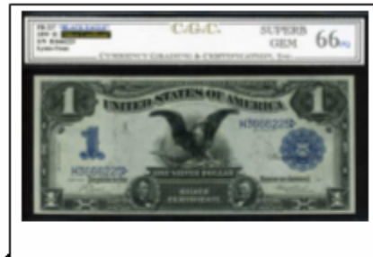
RARER FR.233 $1 Black Eagle CGC-66PQ, Second from Ernest known!