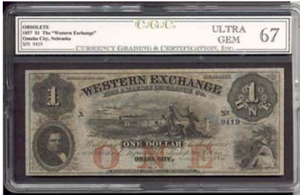
This Obsolete is a 1857 $1 “The Western Exchange” Fire & Marine Ins. Co. from Omaha City, Nebraska in an astonishing grade of CGC-67 Ultra Gem