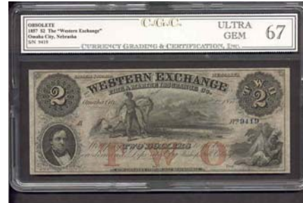
This Obsolete is a 1857 $2 “The Western Exchange” Fire & Marine Ins. Co. from Omaha City, Nebraska in an astonishing grade of CGC-67 Ultra Gem