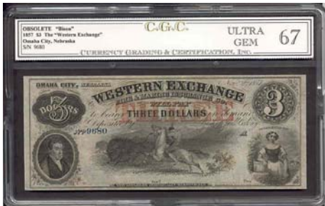
This Obsolete is a 1857 $3 “The Western Exchange” Fire & Marine Ins. Co. from Omaha City, Nebraska in an astonishing grade of CGC-67 Ultra Gem