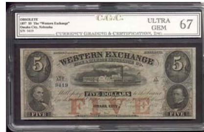
This Obsolete is a 1857 $5 “The Western Exchange” CGC-67 Ultra Gem! The Four notes that complete the set are being offered as a set only * Call Bid!*

This website (and auction area) is here for EVERYONE to sell their notes. There are many more notes (and photo's) also on page 13. To learn how to list/SELL your notes here-call (602) 493-4758 or email: sales@gradedcurrency.com **Cut off bid times are 5pm on Sept. 15 th . For more photos go to GradedCurrency.com