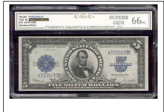
Fr.282 $5 Porthole! CGC has only graded 1 in 66 and this is it! Gorgeously original with vibrant color

To bid or “Buy it Now” on any of these notes just email us at: Sales@gradedcurrency.com or call us Now at (602) 493-4758. Dealers & Collectors List or SELL you notes here: Color Photo's GradedCurrency.com