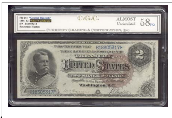
Gorgeous FR.244 $2 Hancock CGC-58PQ This note looks totally Gem!!!