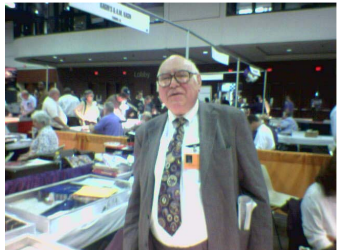
"FUN Show Jan 2004" A Numismatic Legend!