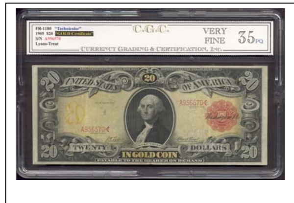
1905 $20 Technicolor! Fantastic Colors and very clean fields! Great margins! Very tough note!