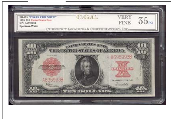
This Fr.123 $10 1923 – CGC 6635Q Great RED inks and paper quality – a very tough note to find!