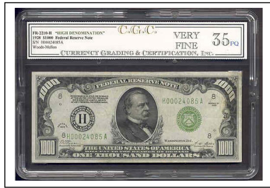
Fr.2210H 1928 $1,000 that looks Unc. but at a very affordable price, great Light Green Seal!