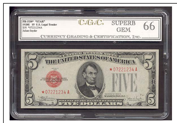
Fr.1530* 1928E $5 Red Seal Legal Tender STAR in CGC-66, Finest known, Pop-Top 1/0!!