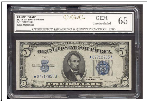
Fr.1651* $5 1934A STAR Silver Cert. CGC-65!!!