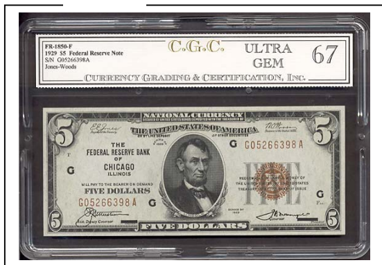
Wow, a Chicago 1929 Brown Seal in CGC-67! Nearly perfect everything, paper, embossing, etc...