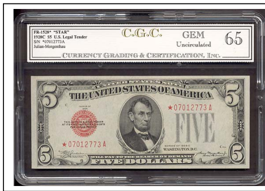
Fr.1528* 1928C $5 Red Seal Legal Tender Star in CGC-65 GEM, won't Last!!!