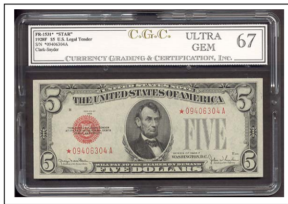
Fr.1531* 1928F $5 Red Seal Legal Tender STAR in CGC-67 Finest Known Pop-Top 1/0!!!