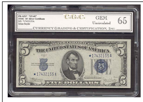
Fr.1653* $5 1934C $5 STAR Silver Cert. in CGC-65 GEM, what a killer note! Pop Top 1/0!

To bid or "Buy it Now" on any of these notes just email us at: Sales@gradedcurrency.com or call us Now at (602) 493-4758. Dealers & Collectors List or SELL you notes here: Color Photo's Graded Currency.com