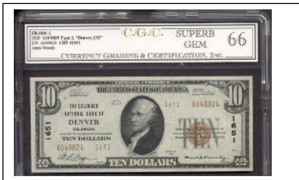
A Superb Gem National west of the Mississippi – Denver, CO (with 43 total smalls, this may be the Finest $10). Great Paper & Color $995.