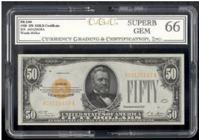
Fr.2404 $50 1928 Gold in CGC-66 Pop Top 1/0!

We're so excited to deliver this service to our collectors, it seems so natural.... The coin industry has been doing it for years. Not everyone can go to Paper Money shows to view such exquisite material, now they don't have to! They can enjoy the Heritage, History and beauty from the comforts of their own home!