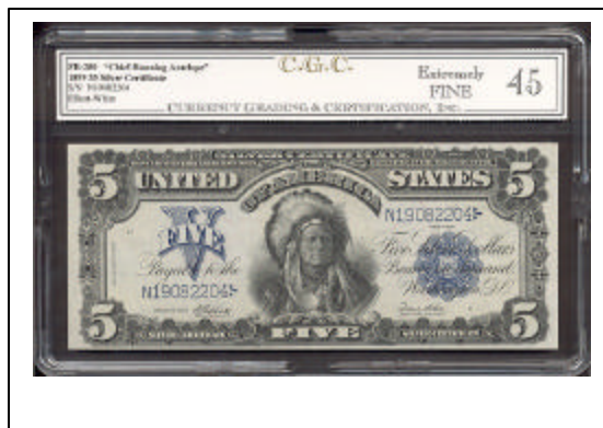
This Chief is just gorgeous, great colors and inking! Chief Running Antelope will probably always be within the top 3 in popularity! $1,695!

To bid or “Buy it Now” on any of these notes just email us at: Sales@gradedcurrency.com or call us Now at (602) 493-4758. Dealers & Collectors List or SELL you notes here: Color Photo's GradedCurrency.com